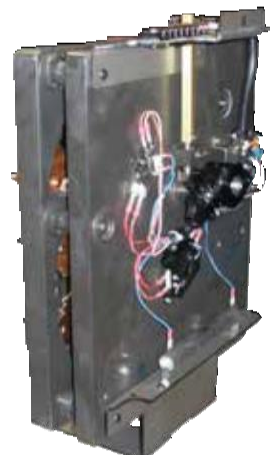
Figure 3. QD3 Quik-Drive tap-changer

The load tap-changer product offering consists of three Quik-Drive™ tap-changers, the most advanced tap-changers in the industry. Each device is sized for a specific range of current and voltage applications and share many similarities in their construction. The primary benefits of Quik-Drive tap-changers are: direct motor drive for simplicity and reliability; high-speed tap selection for quicker serviceability; and proven mechanical life (one million operations). Common Quik-Drive tap-changer features include: neutral light switch; position indicator drive; safety switches; and logic switches (back-off switches). Quik-Drive load tap-changers meet IEEE® and IEC standards for mechanical, electrical and thermal performance.