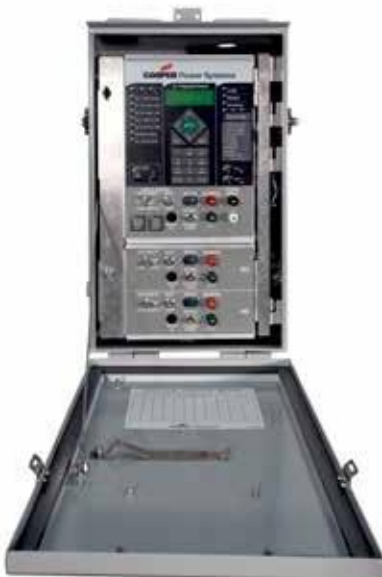
Figure 2. CL-7 Control.