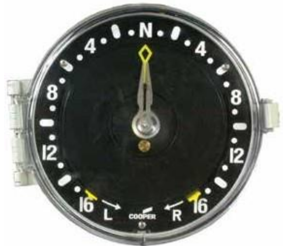
Figure 6. Position Indicator.

The five possible load current ratings associated with the reduced regulation ranges are summarized in Tables 4 and 5. At each setting, a detent stop provides positive adjustment. Settings other than those with stops are not recommended. The raise and lower limits need not be the same value except for locations where reverse power flow is possible.