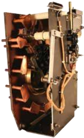
Figure 5. QD8 Quik-Drive tap-changer