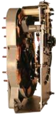
Figure 4. DDD Quik-Drive tap-changer